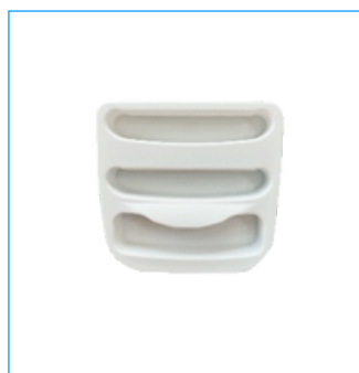
SUPRO handle slot