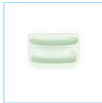
Skylight handle slots