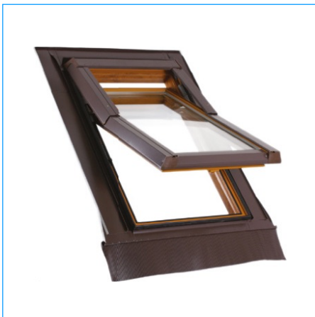
Flange for corrugated roofing