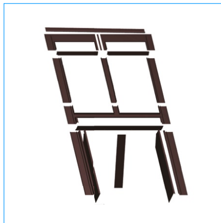
Modular corrugated "F" and flat "P" flange