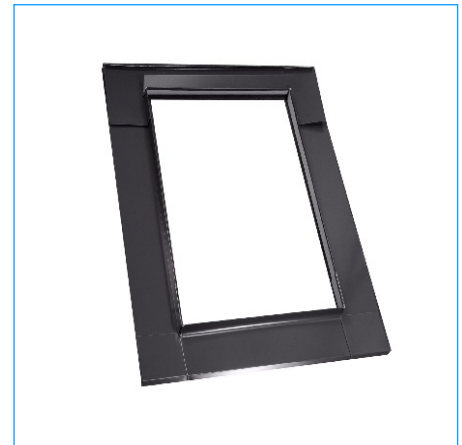
Flange for flat roofs

*Special flanges enable the installation of windows side by side or one above another.